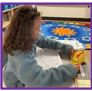
In 1<sup>st</sup> grade math, we are learning to tell time to the hour and the half.