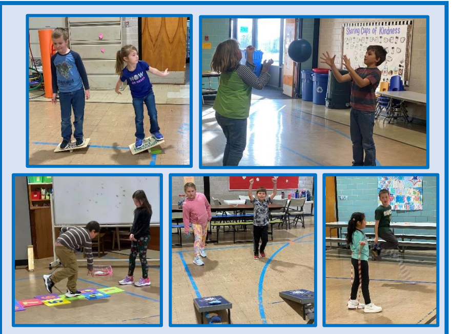
The 1<sup>st</sup>, 2<sup>nd</sup> and 3<sup>rd</sup> graders had lots of fun doing stations this week in gym class!