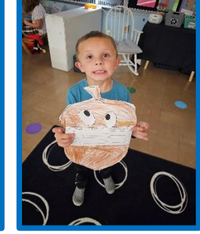
5K fun this week! Firefighters visited, acorn writing and 5 little pumpkins!